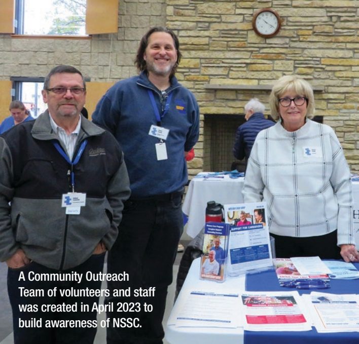
A Community Outreach Team of volunteers and staff was created in April 2023 to build awareness of NSSC.

61,858 hours of service were provided to 22,959 individuals through Senior & Family Services