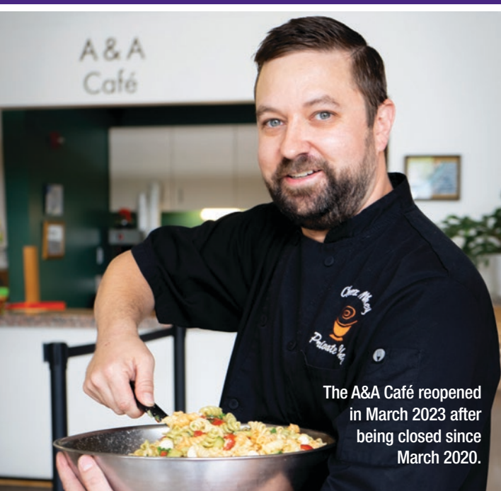
The A&A Café reopened in March 2023 after being closed since March 2020.

14,885 enrollments in 662 Lifelong Learning classes