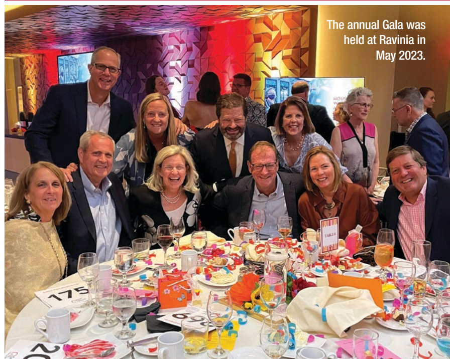
The annual Gala was held at Ravinia in May 2023.

8,417 patients received 13,714 hours of screening through our Choices for Care program to determine what level of care was needed following a hospital stay